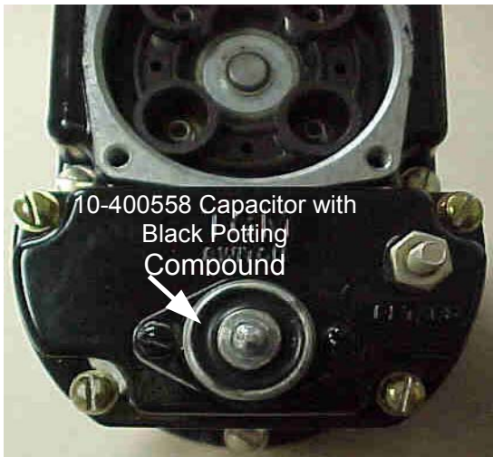
Figure 1 Affected Capacitor